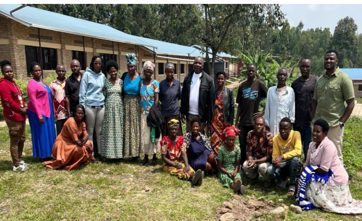
GER Rwanda organized participation in the National Umuganura Day 2023 with URUFATIRO in Musamo Cell. Each year, Rwandans gather to celebrate National Harvest Day. Although it comes once a year, every day should be a day of gratitude for conserving biocultural diversity. GER Rwanda, through URUFATIRO, contributed to the preparation of Umuganura in Musamo Cell.