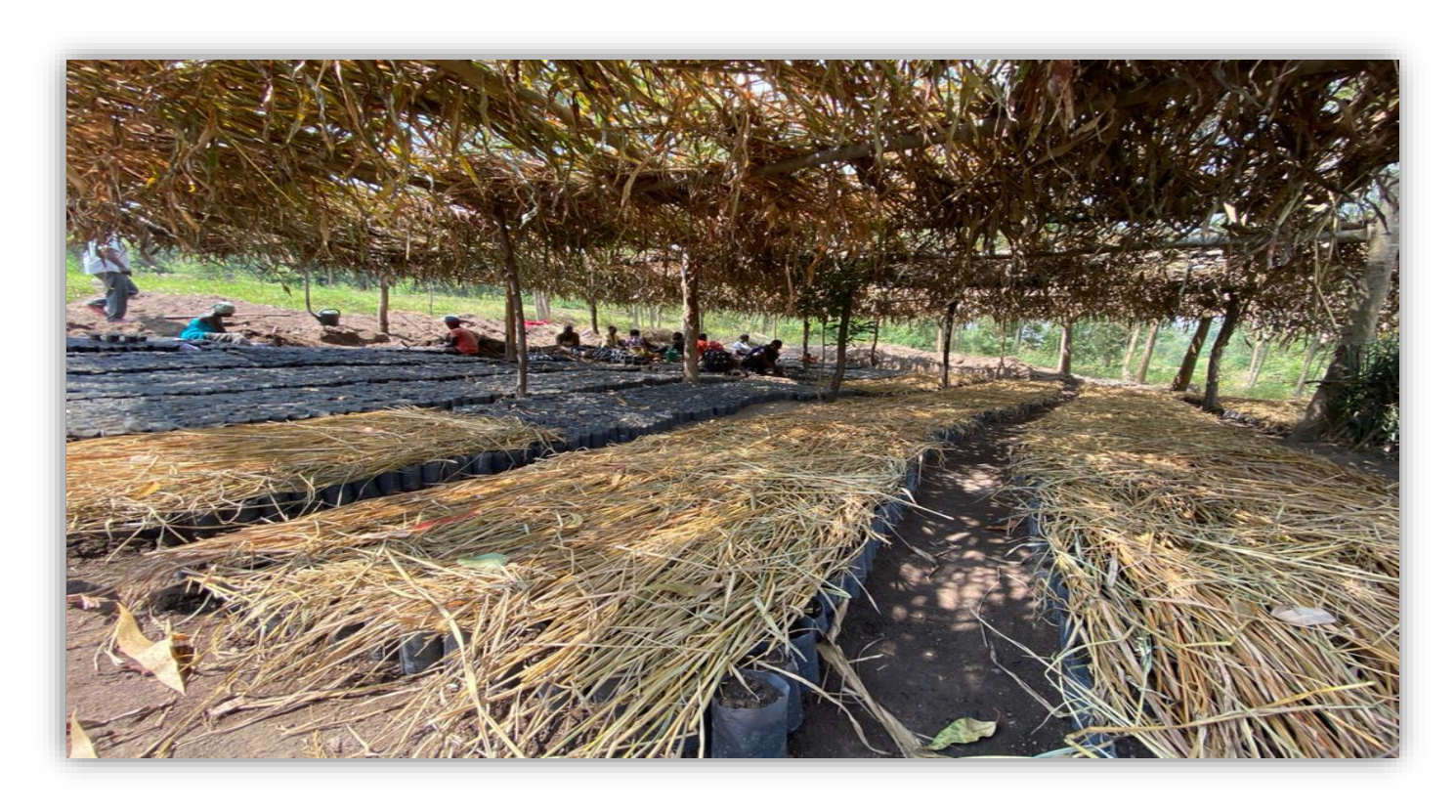
Above: Tree Nursery in Ruhango Sector, Musamo Cell (URUFATIRO Group)