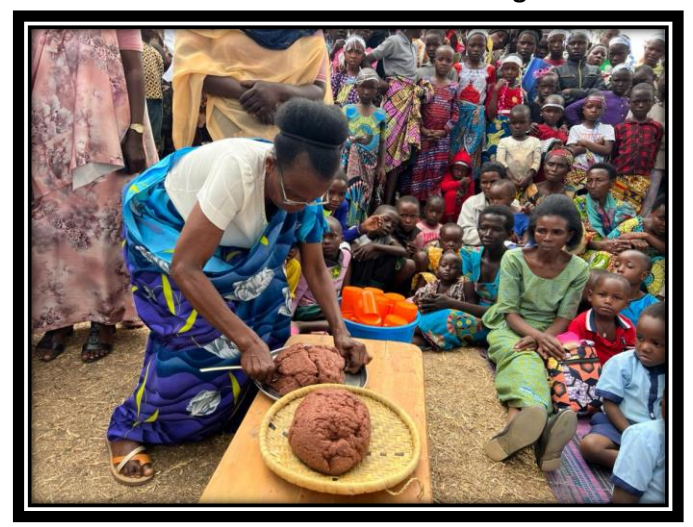
The URUFATIRO Team Collaborating with GER Rwanda for the 2023 Umuganura Day Preparations